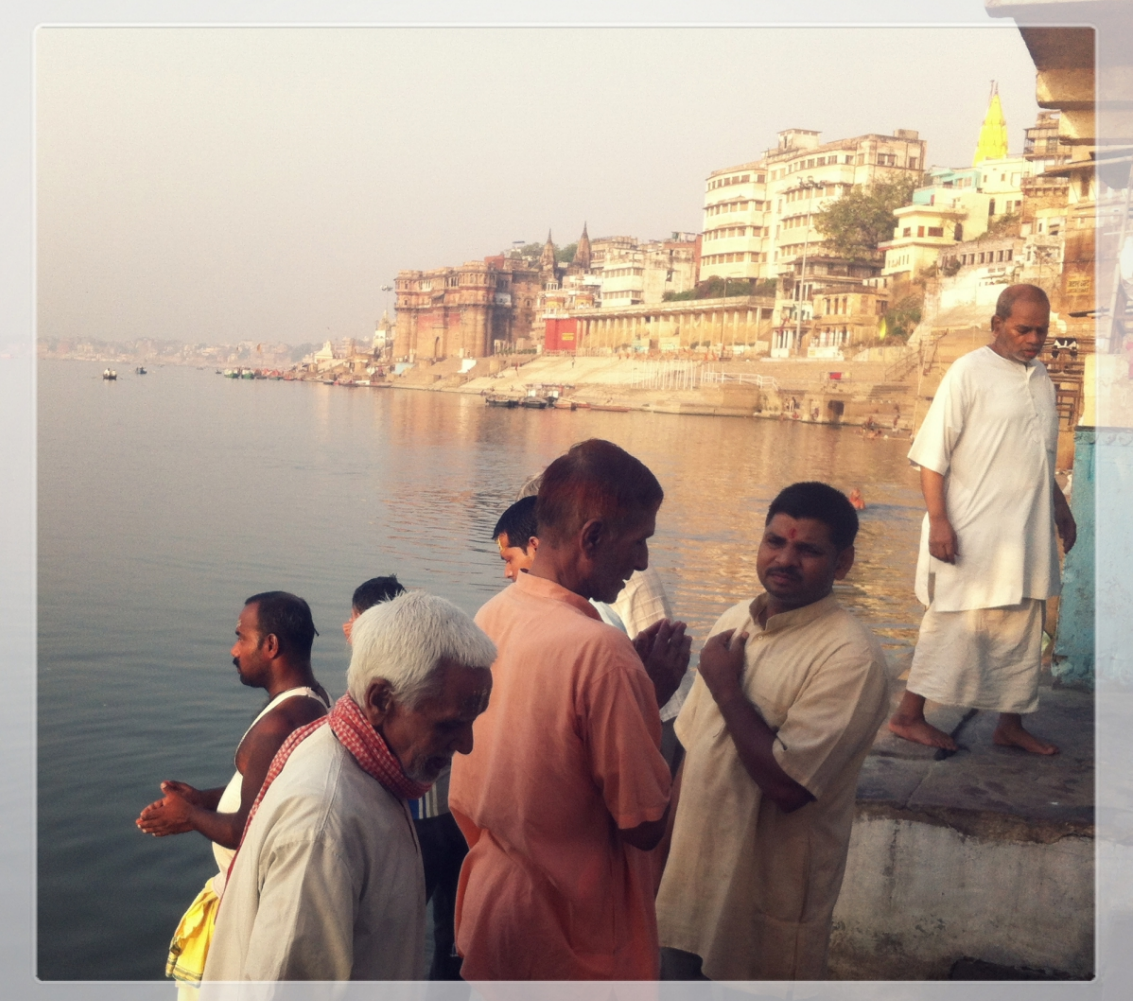
Corwin Trails Selected Field Recordings From India/ Nepal Volume II (Religious Music)